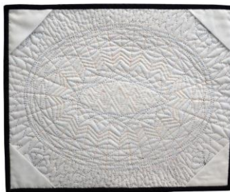
View of back of artwork