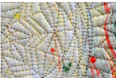
Detail image of artwork

This piece is designed to be displayed in a horizontal or vertical orientation. These experimental pieces are smaller and will be spectacular paired up with several of the other pieces for a collage-type display.